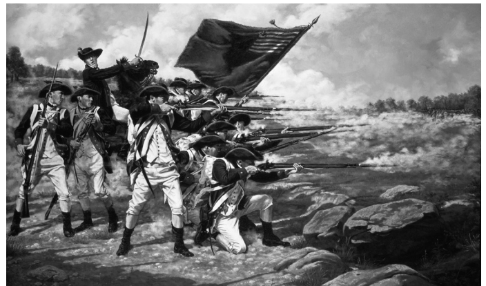
THE MARYLAND 400