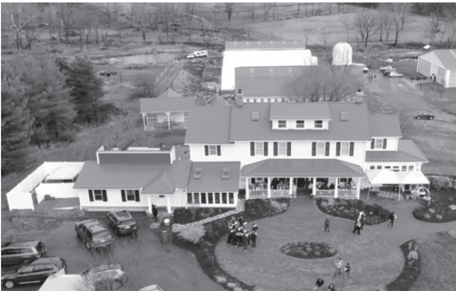
MARY'S LAND FARM

After months of deliberation, the Historical Society board reluctantly decided that the annual Holiday House Bus Tour - a tradition since the 1970's - would not be possible this year. Trying to find owners comfortable welcoming several hundred guests into their homes and concerns about