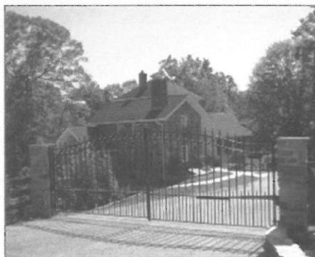
BON AIR MANOR GATEHOUSE