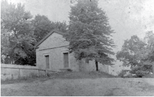
ORIGINAL 1ST PRESBYTERIAN CHURCH CIRCA 1880s