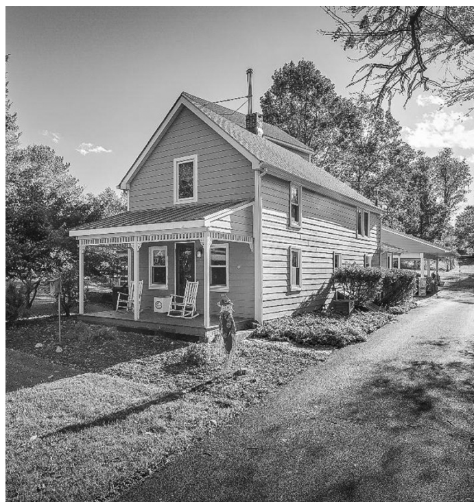
THOMAS FARM TENANT HOUSE