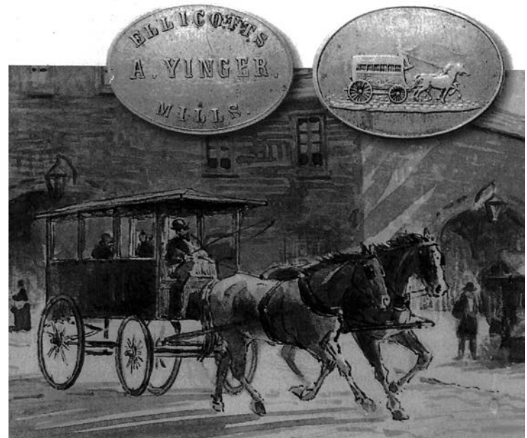
Image of Yinger Omnibus and Yinger Coins circa 1855, photo courtesy of Numismatists Magazine

Only two A. Yinger tokens are known to exist. It is unknown if a token was issued for Catonsville. According to the Numismatists and due to the rarity of these tokens, the value could be estimated between $3000 - $5000.