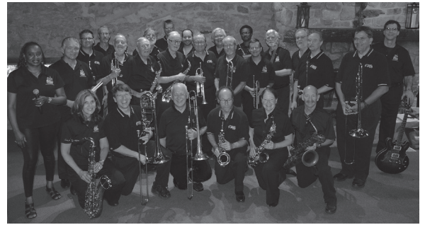
THE COLUMBIA JAZZ BAND