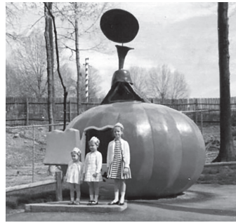
THE ENCHANTED FOREST