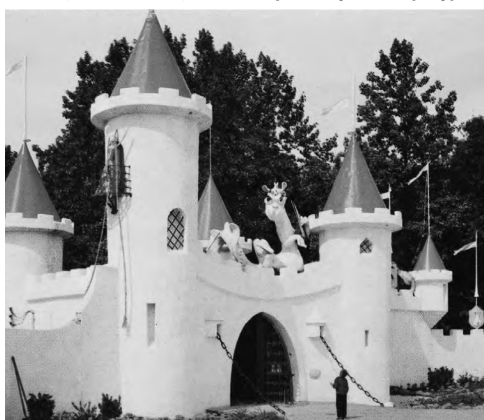
The Enchanted Castle

Now, the only remnant of the park at the original location is Old King Cole, pointing the way into the shopping center. A very happy ending to the tale. *