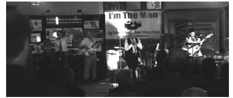
I'M THE MAN!