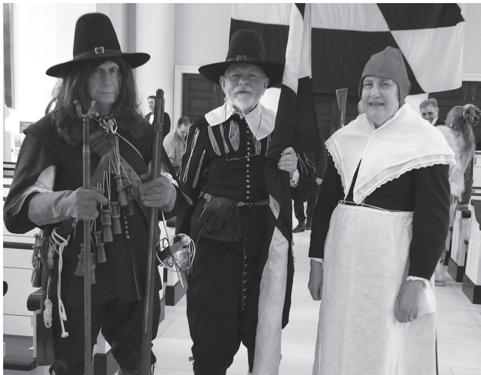
REPRESENTATIVES OF ST. MARY'S COUNTY