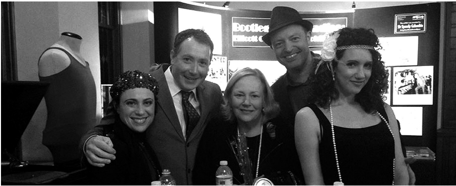
BOOTLEGGER'S PARADISE PARTY