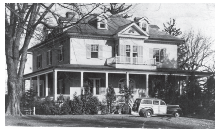
PROFESSOR MAUPIN'S UNIVERSITY SCHOOL FOR YOUNG MEN

In addition to St. Charles College, Howard County also offered St. Mary's in Ilchester, College of the Sacred Heart at Woodstock and St. Timothy's in Catonsville (within 10 miles).✚