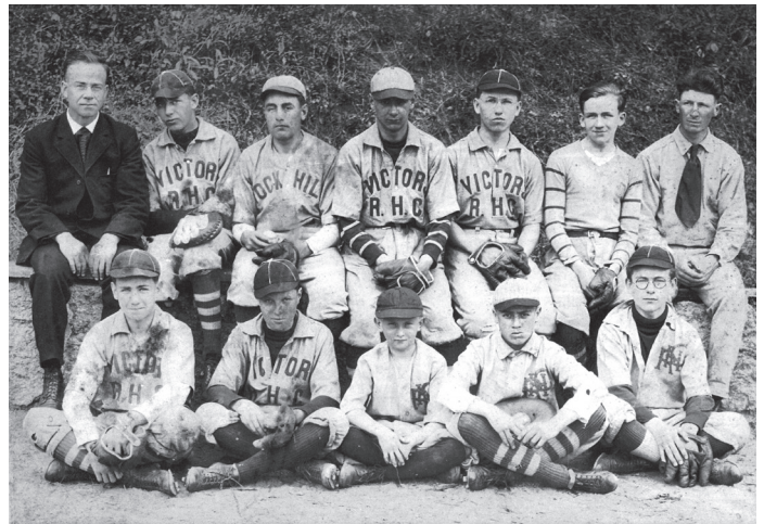
ROCK HILL BASEBALL TEAM

Rural towns in Howard fielded baseball teams including Ellicott City, Savage, Dayton, Elkridge and others. In 1912 a team composed of Ellicott City merchants played a game at Rock Hill College against a team composed of court house workers. It was won by the merchants by a score of 10-7.