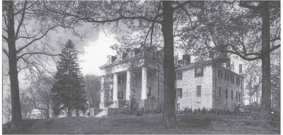
ABOVE: THE PATAPSCO FEMALE INSTITUTE RIGHT: ROCK HILL COLLEGE

tute, situated on land given primarily by the Ellicotts, opened for girls aged 12 to 18 years. This school was lifted to a national status in 1841 by Almira Hart Lincoln Phelps, Headmistress. Almira believed that young women should not obtain just an ordinary finishing school education, but also be prepared to earn a living. She wrote some of the textbooks used in the Institute which included botany, chemistry, geology and natural philosophy. Students came from all over the United States and Europe to obtain the best education available at the time. The graduates were expected to seek employment as school teachers or in the business world. It is easy to understand how the advanced attitude of education of Mrs. Phelps blended with the education ideals of the Ellicott Brothers.