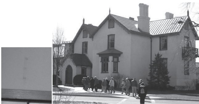
MEMBERS AND FRIENDS ENJOYED A LOVELY TRIP TO WASHINGTON TO VISIT THE LINCOLN COTTAGE.