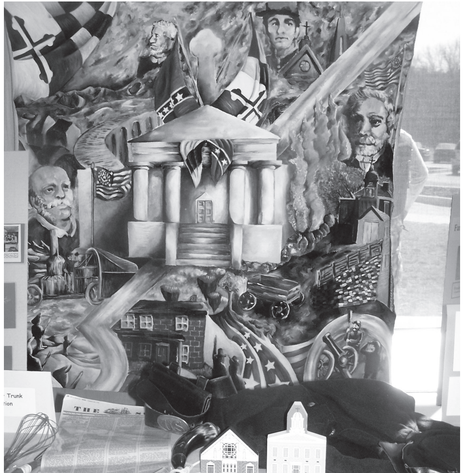
THE RESERVOIR HIGH SCHOOL ART DEPARTMENT CREATED THIS SPECTACULAR MURAL OF THE CIVIL WAR PERIOD — ONE OF FIVE THAT WERE CREATED FOR THE EVENT BY AREA HIGH SCHOOLS.

Among the various wonderful displays were five murals created for each era by various local high school art departments. Those involved were Centennial High School for the Native American Period, Hammond