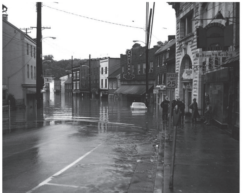
FLOODWATERS REACHED UP THE STREET TO LEIDIG'S BAKERY

continues to be a problem in these low lying areas near streams and rivers. We can only hope that a storm with the destructive properties of Tropical Storm Agnes will not occur again. 🏠