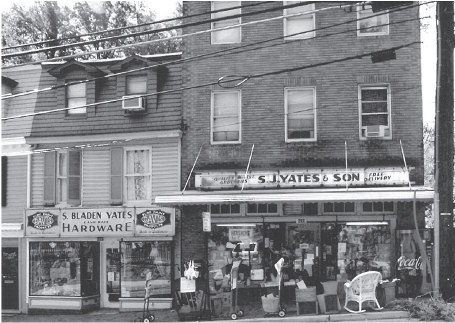
YATES MARKET AND YATES HARDWARE SERVED MAIN STREET FOR OVER A CENTURY.