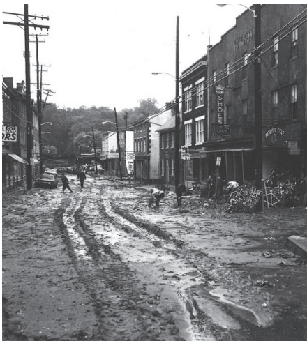
MUD AND DEBRIS FILLED THE STREET WHEN THE WATER RECEDED

they did, although the clean-up was daunting. The Bicentennial celebration was a huge success, with people celebrating their recovery from the ravages of nature.