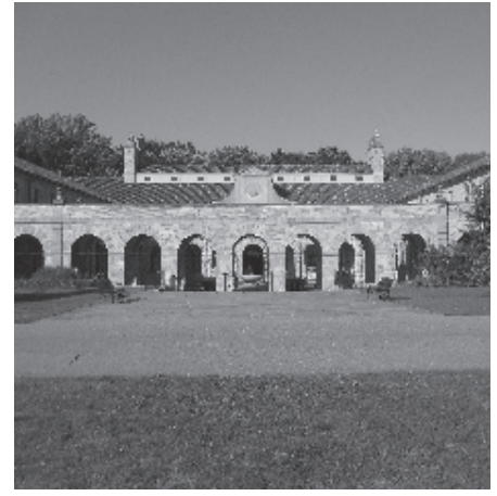
SHRINE OF ST. ANTHONY'S