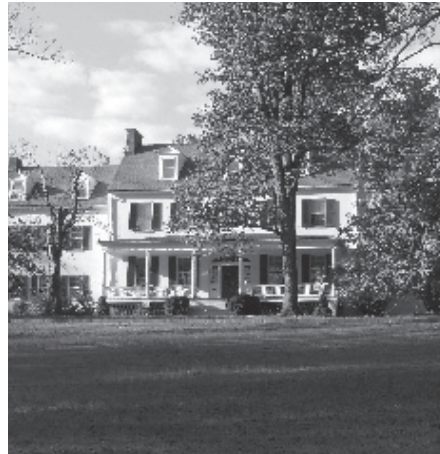
WHITE HALL MANOR