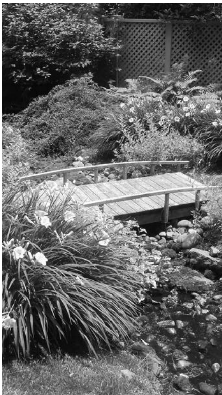
SPRING HILL QUARTERS

OWNERS OF SIX SPECTACULAR HISTORIC PROPERTIES PLUS THE SHRINE OF ST. ANTHONY'S WILL OPEN THEIR HOMES AND GARDENS TO VISITORS ON THIS ANNUAL SELF-GUIDED TOUR. TOUR GOERS CAN LOOK FORWARD TO A WIDE RANGE OF HORTICULTURAL AND ARCHITECTURAL DELIGHTS AS THEY EXPLORE THE FOLLOWING SITES.